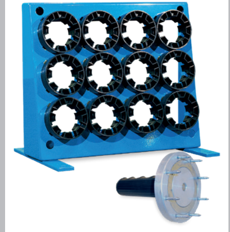
Tool base and Tool rack with QuickChange-tool as an option.